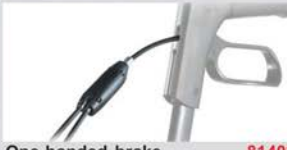
One-handed brake 814026