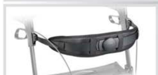
Adjustable back support with padding 814607