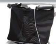
Net basket 814625