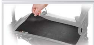
Anti slip mat for tray 814059