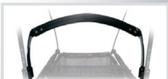
Back Support for TROJA Walker 814765