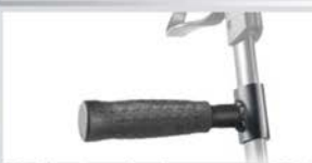
Guiding handle for the visually impaired 814014