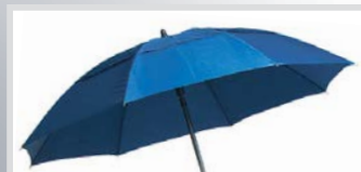
Umbrella 814735 (not for sale in Germany) 157207