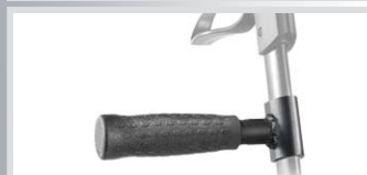
Guiding handle for the visually impaired 814014