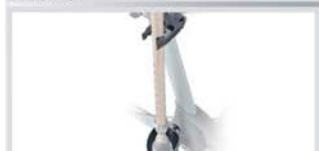
Crutch holder 814025