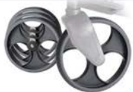
Comfort Wheels Grip (TPE) 814617 Set of 4