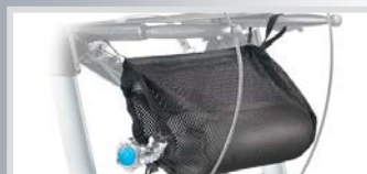
Basket for oxygen bottle 814009 (only compressed, not liquid) X