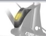
LED light with integrated fall alarm 814609