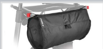
Rear bag with zipper X 814046