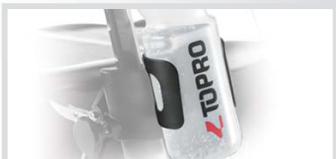
Bottle holder 814043