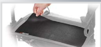
Anti slip mat for tray X 814059