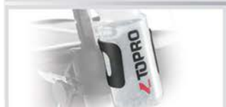
Bottle holder 814043