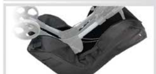
Transport bag 814042