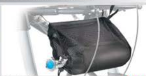
Basket for oxygen bottle 814009 (only compressed, not liquid)