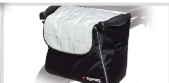
Shopping bag with cover and shoulder strap X 814140