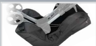
Transport bag 814042