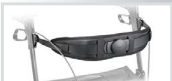
Adjustable back support 814726 with padding, for rollators from 2009