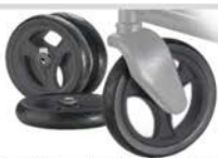
Comfort Wheels Soft (PUR) 814610 Set of 4