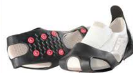
Ice spurs for shoes Size M (shoe size 36-40) 814029 Size L (shoe size 41-46) 814035