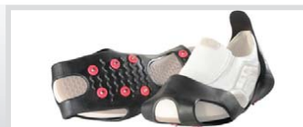
Ice spurs for shoes Size M (shoe size 36-40) 814029 Size L (shoe size 41-46) 814035