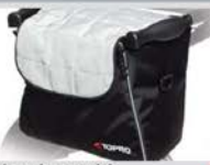
Shopping bag with cover and shoulder strap 814622