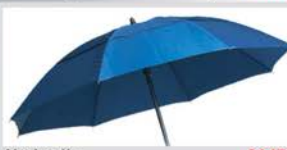
Umbrella 814735 (not for sale in Germany)