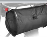
Rear bag with zipper 814046