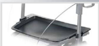
Tray X 814728