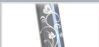
Flower stickers, set with 4 stickers 814141