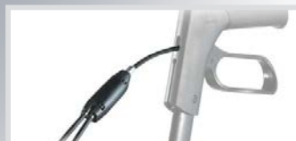
One-handed brake 814026 157197