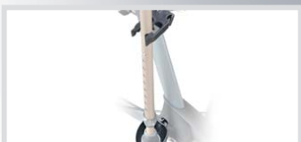
Crutch holder 814025